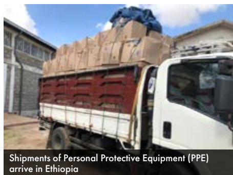
Shipments of Personal Protective Equipment (PPE) arrive in Ethiopia

Following the outbreak of COVID-19, early guidance from WHO, anticipating a reflection of the high mortality rates in China and Italy, was to suspend all community based NTD control activities.